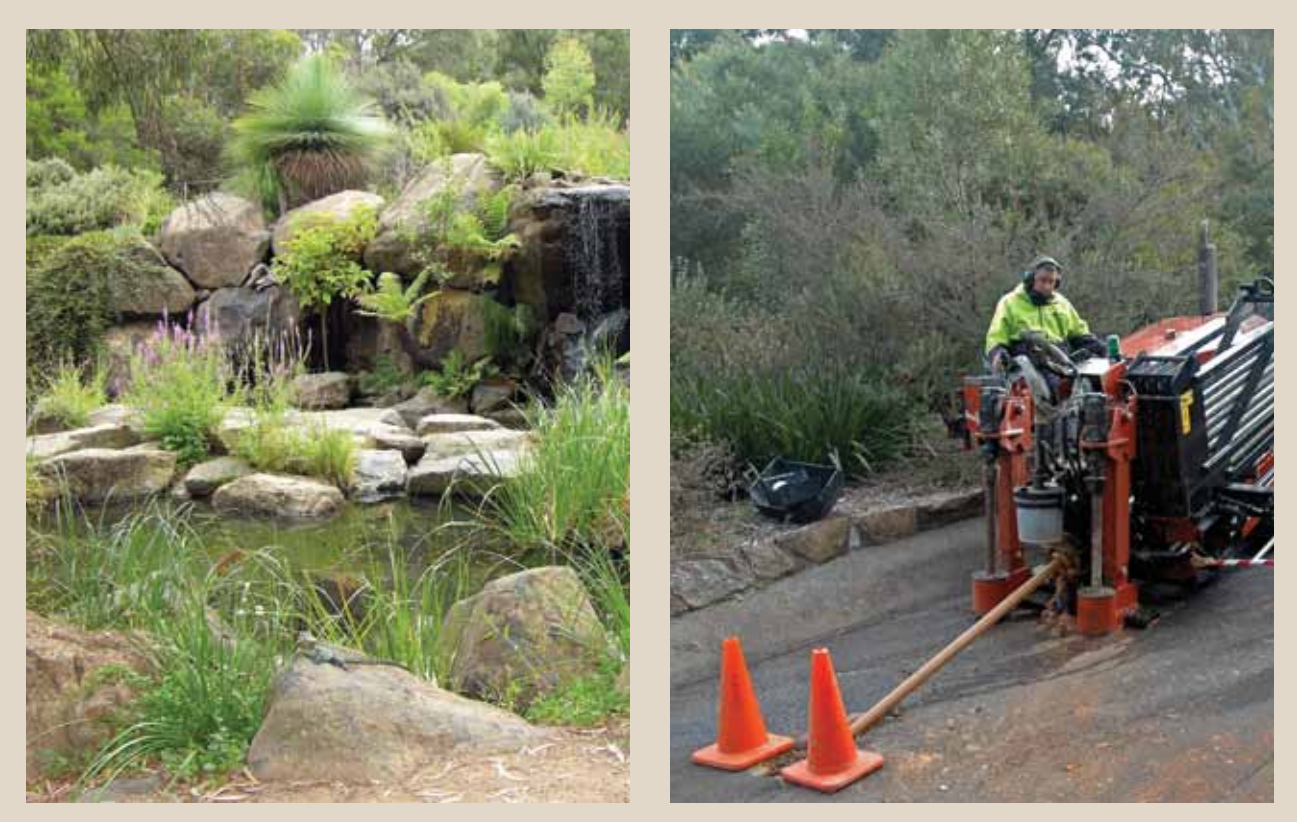
A new pipe network to water Gardens' plants with non-drinking water from Lake Burley Griffin will help provide a more sustainable future for the collections.

The project is on schedule to be watering the living collection from non-drinking water by this summer. Using water from Lake Burley Griffin ensures long-term sustainability by reducing the Gardens' operational costs and reliance on Canberra's drinking water supply. The project is expected to free up around 170 megalitres of drinking water per year for other uses in Canberra.