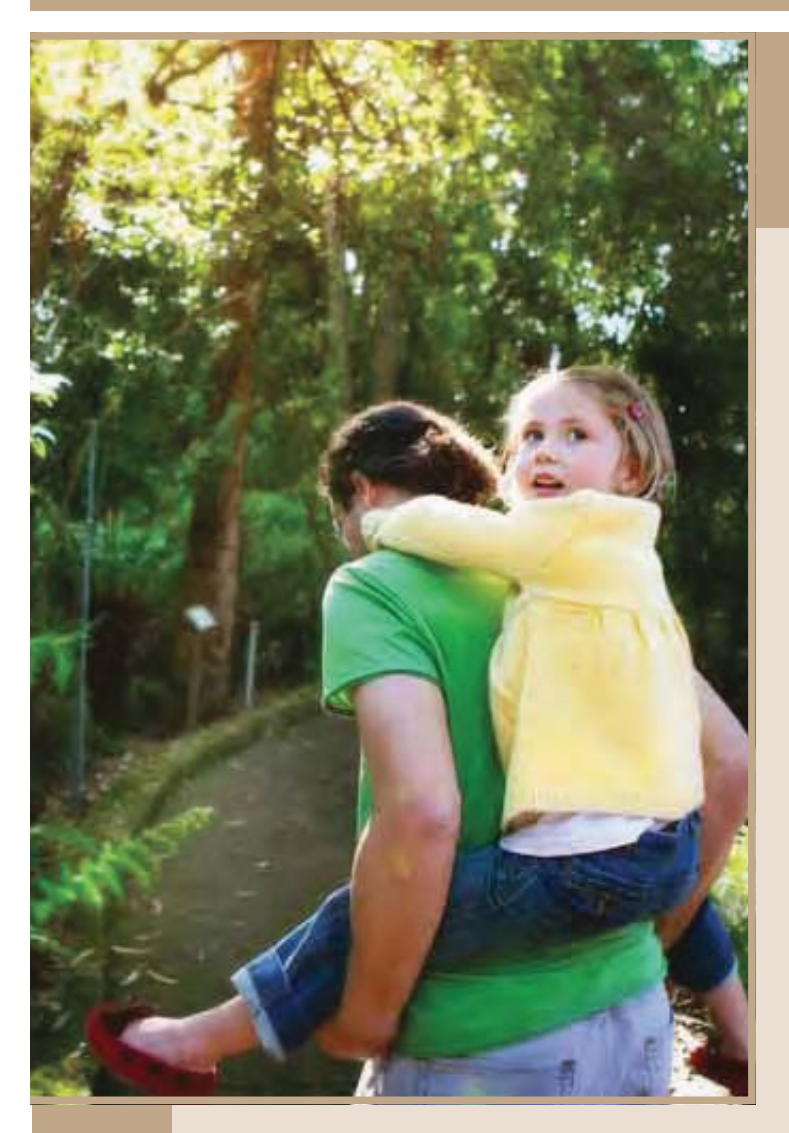
The Australian National Botanic Gardens is a national showcase for the horticultural use of Australia's native plants

Australia-wide consultation for the ANBG's next management plan brought out some definite views on the ANBG's role for the next ten years.